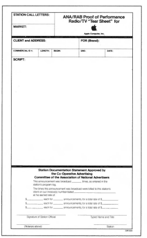
Radio/TV Proof of Performance Tearsheet P/N A2F0016