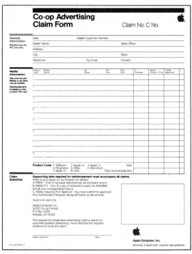
Apple Computer Co-op Claim Form P/N A2F0065-C