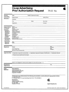
Prior Authorization Request P/N A2F0076-B

To ensure prompt reimbursement, the appropriate forms should be used when filing co-op claims or requesting prior authorization. These forms can be ordered from the Apple Support Center, just like any other Apple product. They are found in the Dealer Price List (see Miscellaneous Sales Support Items).