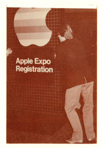
RESOURCEFUL EXPO ORGANIZERS managed to hold general admission day in New York City, despite a fire adjacent to the Statler Hotel. The opening was delayed for a half hour while registration tables were moved away from smoke and water.