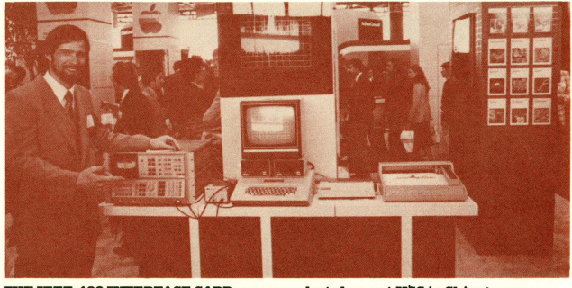
THE IEEE-488 INTERFACE CARD, a new product shown at NCC in Chicago, was demonstrated by Apple II Product Marketing Manager Mike Connor. The configuration used in the NCC demo – in which the card controlled a spectrum analyzer and a plotter —was also used to measure and analyze Apple II radio frequency emissions for the FCC.