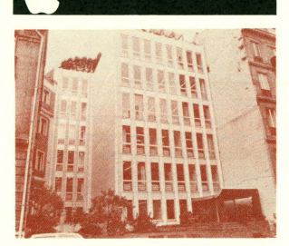
PARIS OFFICES opened in early March as Apple's European marketing and sales headquarters.