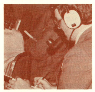
LIGHT-WEIGHT HEADPHONES allowed guests at the Apple Pie seminars to hear their own speakers without interference from adjacent meetings.